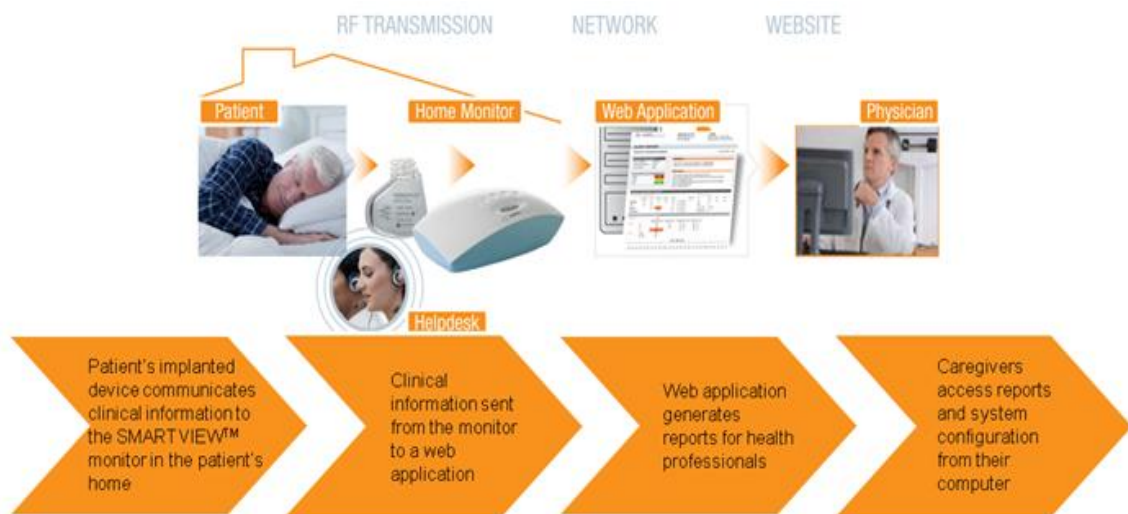
Table 2: SMARTVIEW: a remote monitoring solution for patients with implanted cardiac rhythm management (CRM) devices 10 .

Table 2 below shows how the SMARTVIEW remote monitoring solution from Orange Business Systems and Sorin Group allows healthcare providers to get access to valuable cardiac data and alert messages from Sorin's implantable pacemaker, while the patient is at home. Sorin's CMD, called PARADYM RF, is a smart pacemaker equipped with an accelerometer to allow adaptation of pacing to suit the patient's activity. It is also equipped with the RF wireless technology which enables to remotely monitor the patients who have the Sorin SMARTVIEW Monitor installed at home 9 .